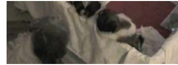
4 stolen puppies anonymously returned in Sussex Dec. 01, 2011

Divorcing couple must swap Facebook and dating site passwords (Naked Security – Sophos)